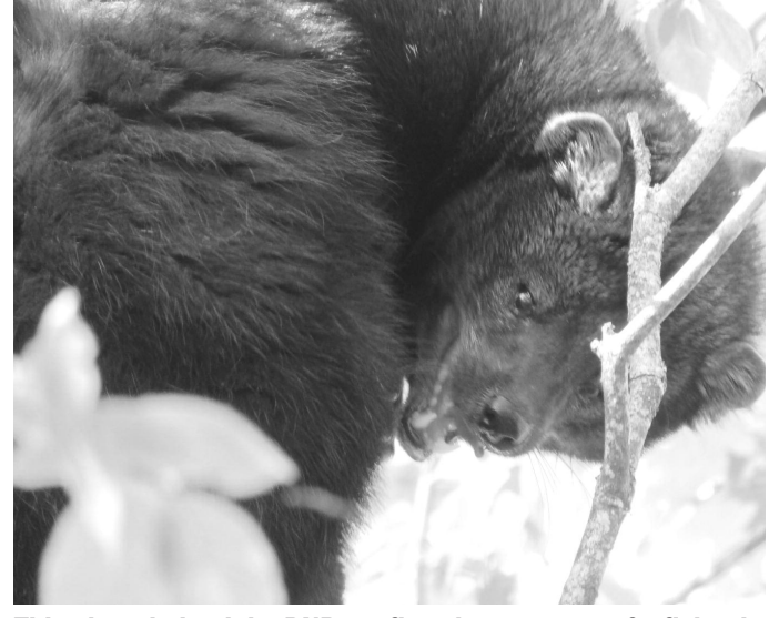
This photo helped the DNR confirm the presence of a fisher in Presque Isle County.

Now that fishers have been confirmed in the Lower Peninsula, the DNR would like to gather additional information. Those who believe they have seen a fisher in the northern